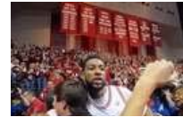
Indiana 73, Kentucky 72