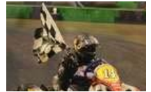
Tony Stewart Wins Karting Race