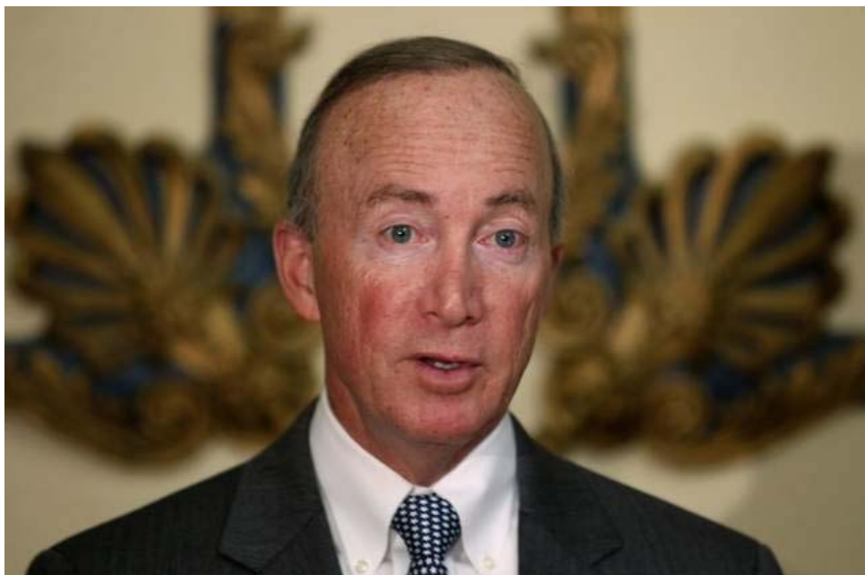
Indiana Gov. Mitch Daniels said he'll be trying to check some things off his to-do list that he has sought in earlier legislative sessions, including criminal justice and local government reforms.