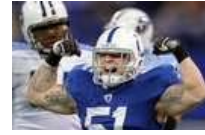
Colts Break Drought With 27-13 Victory