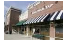
Bars with good food