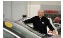
80-year-old car salesman