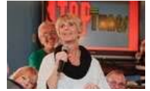
Just Judy's Closing