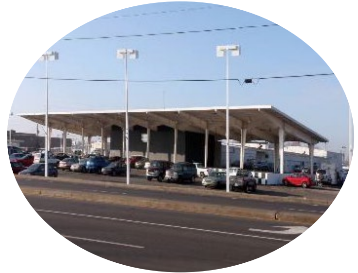
4090 Lafayette Rd