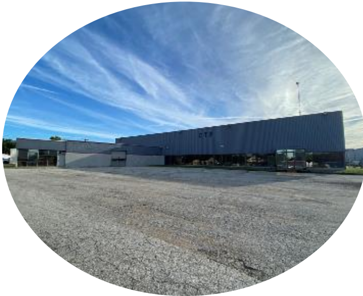
3555 Madison Ave