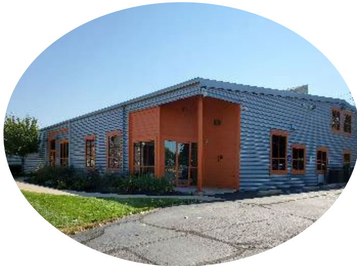
2425 W Michigan St