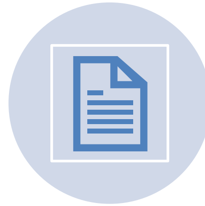
TITLE VI COMPLAINT PROCESS AND PROCEDURES