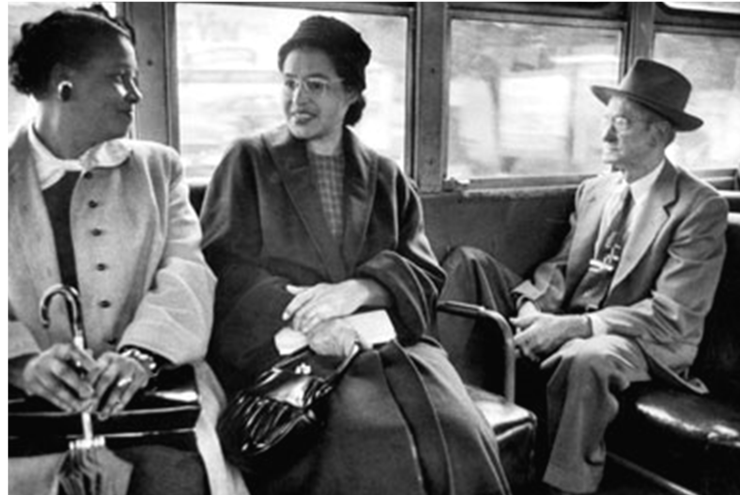
This Photo by Unknown Author is licensed under CC BY