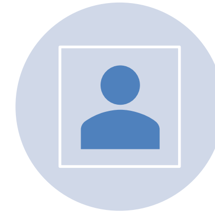
TITLE VI COMPLAINT LOG