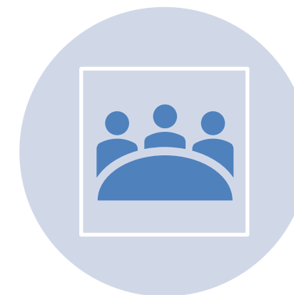
TABLE DEPICTING MEMBERSHIP OF NON-ELECTED COMMITTEES AND COUNCILS