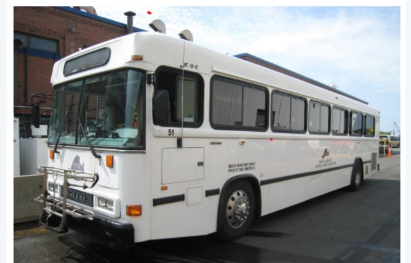
2010 photo via MassDOT