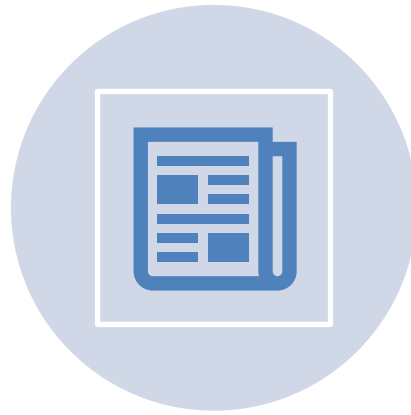
TITLE VI NOTICE TO THE PUBLIC