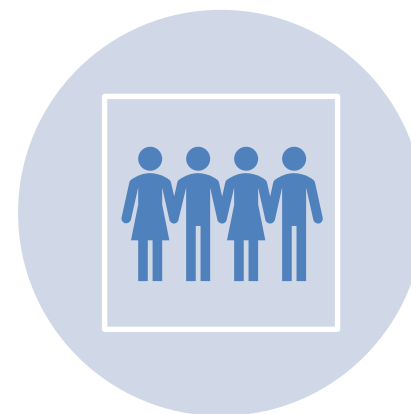
PUBLIC PARTICIPATION PLAN