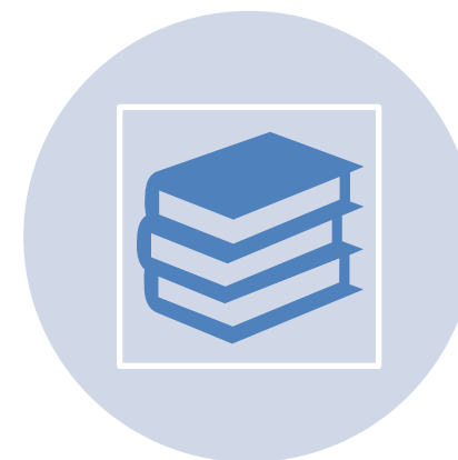
LANGUAGE ASSISTANCE PLAN (INCLUDING FOUR FACTOR ANALYSIS)